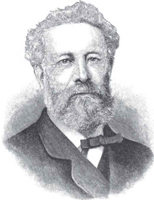
Jules Verne 1828 - 1905 Author, Visionary